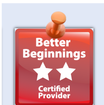
LEVEL 2 TOOLKIT