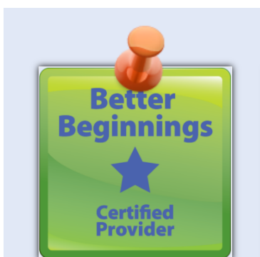
LEVEL 1 TOOLKIT

We even have these special starkits to help you teach your client families about your quality level rating and what it means to be a Better Beginnings provider.