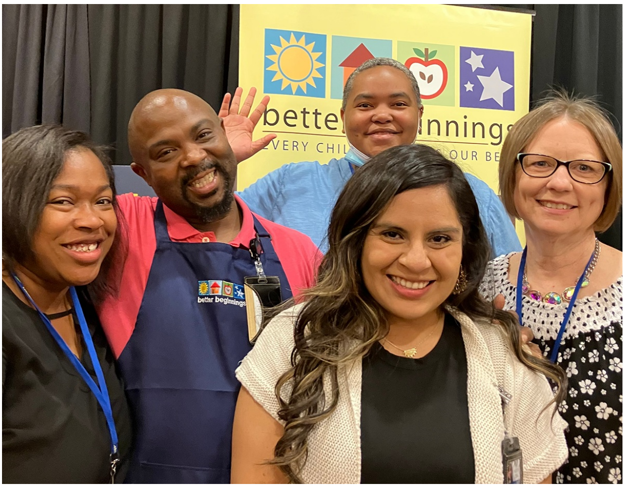
Better Beginnings staff members pose for a quick photo in front of our booth.