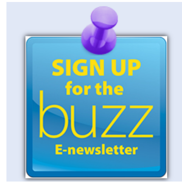
SIGN UP FOR THE BUZZ

DON'T FORGET TO CHECK US OUT ON PINTEREST