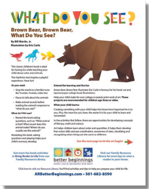
What Do You See?