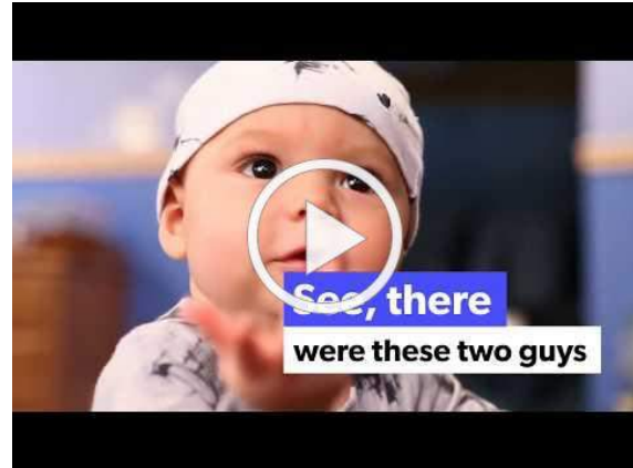
BRING BOOKS TO LIFE